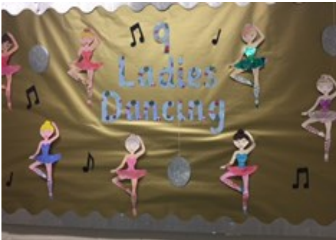
By Fine Class