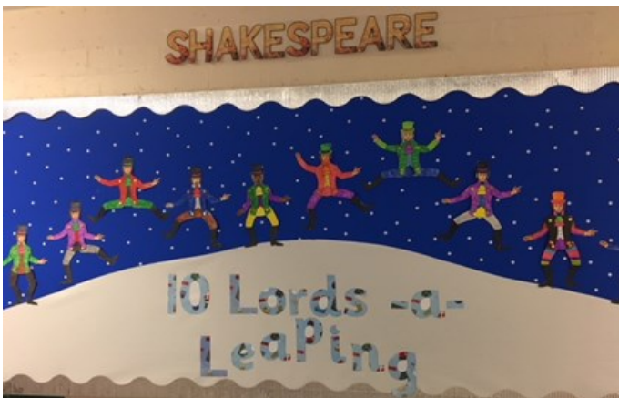
By Shakespeare Class