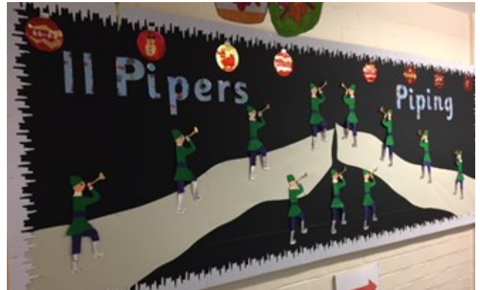
By Tolkien Class